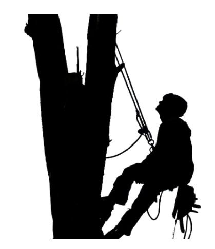
December 9-10, 2024 ISA Exam – Dec. 11

NC Cooperative Extension Guilford County Center